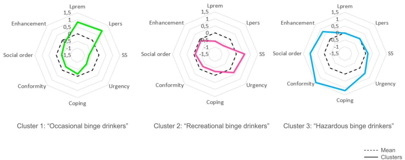
Fig. 1. The three binge drinking clusters.